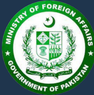
ATTESTATION FROM FOREIGN AFFAIR