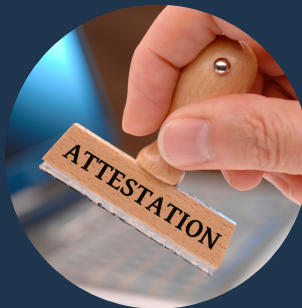
COMMERCIAL DOCUMENT ATTESTATION SERVICES