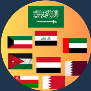
ATTESTATION FROM EMBASSY

SIMPLIFY YOUR COMMERCIAL DOCUMENT ATTESTATION PROCESS WITH OUR EXPERT SERVICES