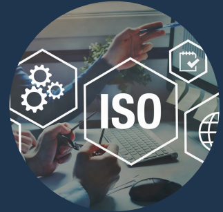
CERTIFICATION FROM DIFFERENT BODIES CONSULTATION SERVICES