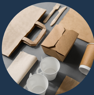
PRODUCT PACKING CONSULTING