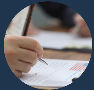
VISA PROCESS SERVICES