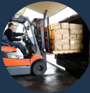
DUTY DELIVERY UNPAID (DDP)