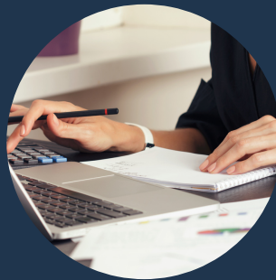
EXHIBITION DOCUMENTATION PREPARATION