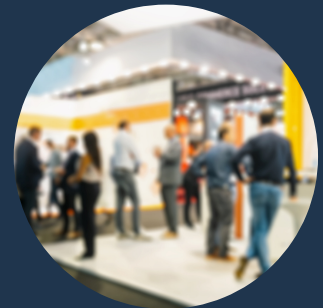
EXHIBITION / VISA PROCESSING SERVICES