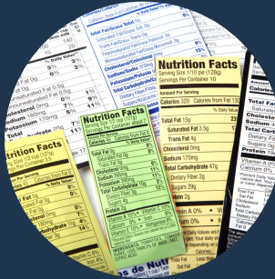
PRODUCT LABELING / ARTWORK SERVICES