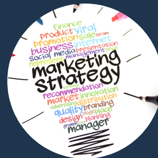
EXPORT MARKETING SERVICES