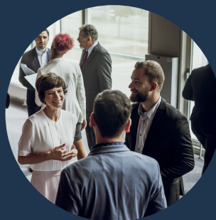
INT'L EXHIBITIONS & EVENTS