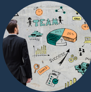
EXPORT MARKETING STRATEGIES