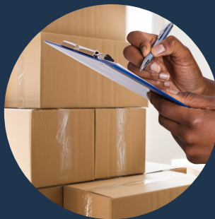
FOOD SAMPLE DISPATCH SERVICES INTERNATIONALLY