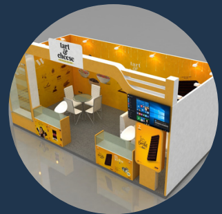
STALL DESIGN AND PASTING

When it comes to participating in international exhibitions and trade shows, the documentation process and visa requirements can often be overwhelming. At Easy Exports Co., we specialize in providing comprehensive exhibition documentation and visa process services to simplify your global business ventures.