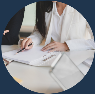
EXPORT DOCUMENTATION SERVICES